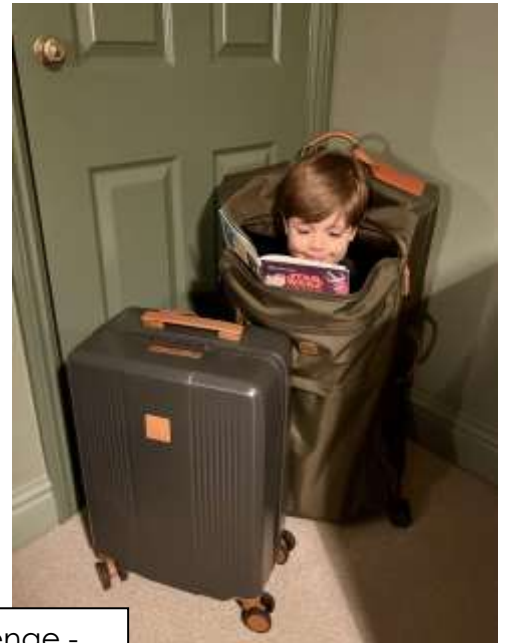
Some entries from the reading challenge - reading in an unusual place!