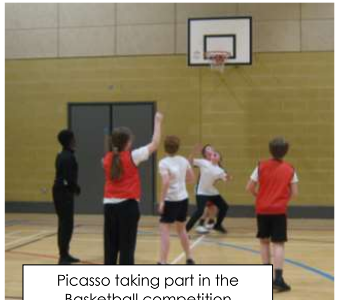
Picasso taking part in the Basketball competition