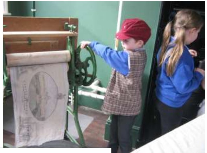
Monet Class trip to Peterborough Museum