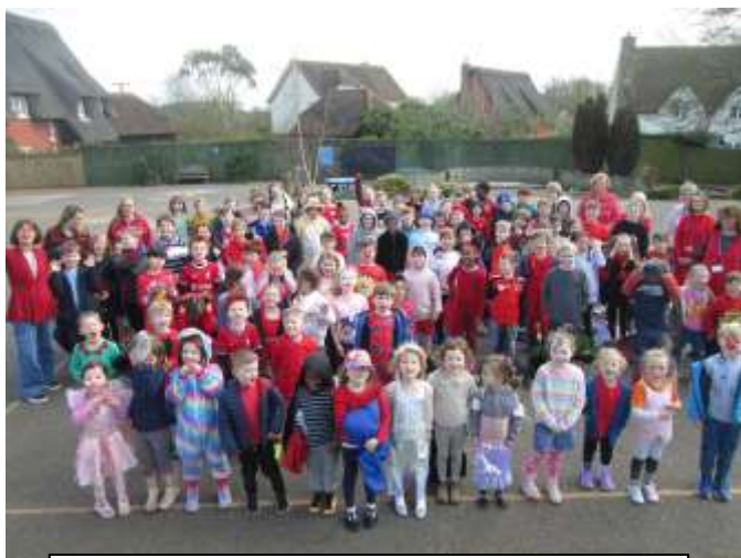
Whole School Comic Relief The final total raised was £190! Thank you everyone who donated.