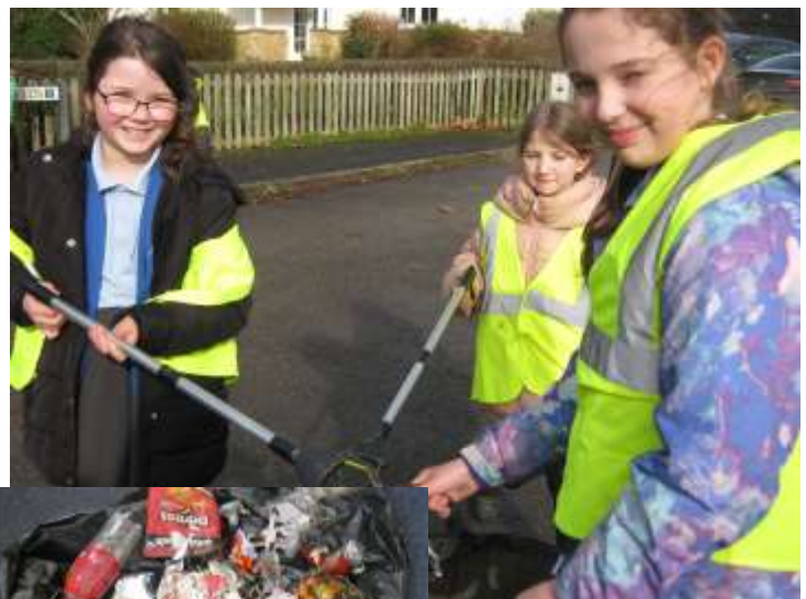
Litter picking in the village