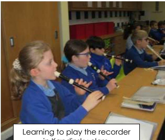
Learning to play the recorder in Kandinsky class.