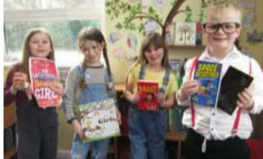
World Book Day dress up