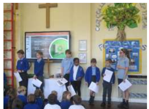
School Council did a whole school assembly about their Spring focus of Waste Minimisation