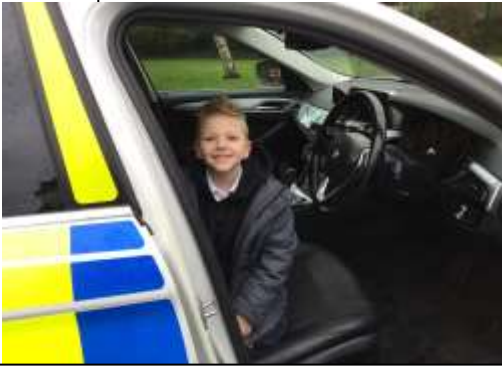
Van Gogh Class had a visit from the Police to support their topic of People who help us