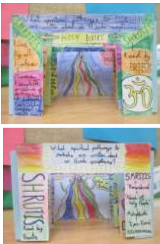
What spiritual pathways to Moshka are written about in Hindu Scriptures? The children expressed the answer to the question by creating a tunnel book.