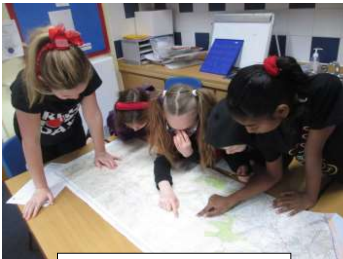
Interpreting contour lines in Geography