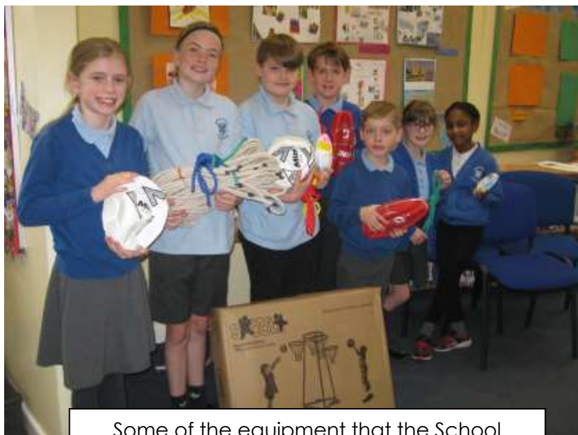
Some of the equipment that the School Council have bought from the amazing amount of money raised from the Sponsored Walk. Lots more things still to come.